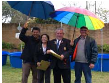
The show must go on—despite the miserable wet weather.