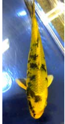
September: Hikari Utsuri (Kin Ki Utsuri), Fred & Rita Grech