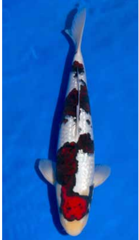
The 2011 Young Koi Show Grand Champion. What a superb koi... even the Japanese would be proud.

The full story on the Show and all the winning koi will appear in the next issue of our magazine.