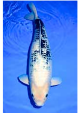
(9) A Gin-Rin Matsukawabake with a clean white head.