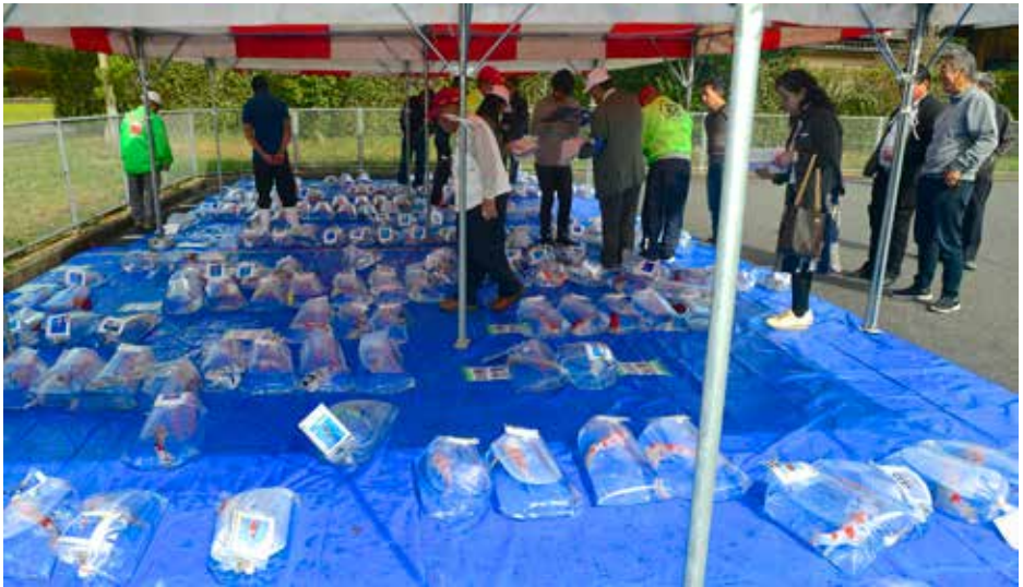
Young Koi Show in Japan held in Niigata.