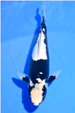
(7) A Kumonryu with superb sumi, also on the head.