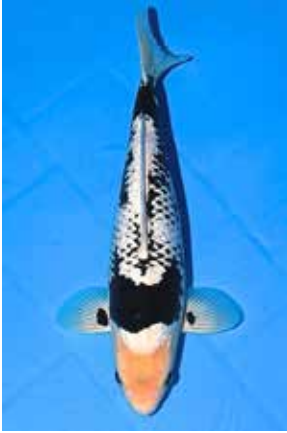
(10) An interesting Gin-Rin Matsukawabake with more sumi but spoiled by the dark head.