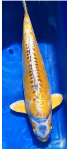
Metallic Doitsu Edison Jap Size 3, Metallic Doitsu (30cm)