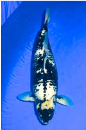
(13) A dark Matsukawabake.