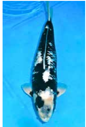
(3) Excellent quality cannot compensate for a poor shape.