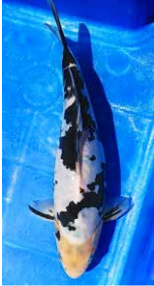
Non-metallic Doitsu Size 3 Edison Jap (30cm) Breeder: