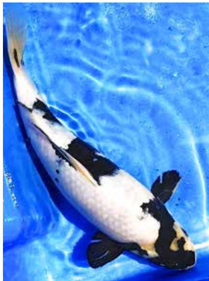
Utsurimono Size 2