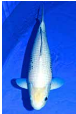
(8) An unusual minimal Matsukawabake. Note the lovely black eyes and clean white.