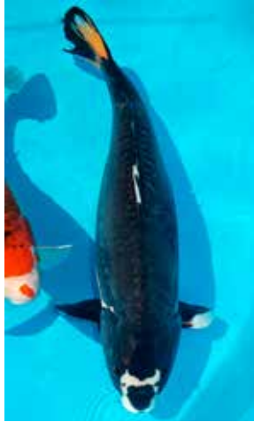
(23) Almost no white left on this large Kumonryu.

Perhaps the most desirable and well recognised of the Karasugoi, Kumonryu are always doitsu (photo 15) and for an AKA show would be classified as non-metallic doitsu. Either kagamigoi (at most four rows of scales including one at each lateral line) or kawagoi—practically scale less, Kumonryu are named after dragon paintings because of the preferred wavy sumi patterns between dorsal and lateral lines, rather like the hi patterns of a Hana Shusui (photo 16). However, this favoured arrangement of sumi is the exception rather than the rule and sumi