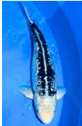
(2) A fascinating, high quality Gin-Rin Matsukawabake.