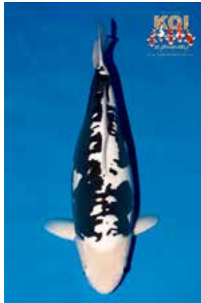
(20) Beautiful clean white on this stunning Kumonryu.