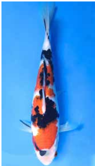
Showa Sanshoku Size 2 TK Hing (22cm) Breeder: TK