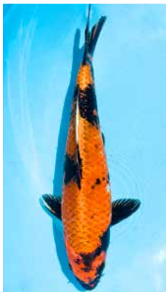
Hikari Utsurimono Size 2