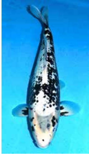
(11) Another look for Matsukawabake.