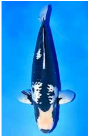
(1) Sumi on this Matsukawabake is quite stunning.

Patterns for the Karasugoi can be very variable but the basic requirement of clear pattern edges applies to all, especially trailing edges of the pattern on a fully scaled koi and all edges on doitsu koi.