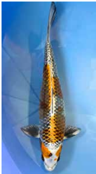
Hikari Moyomono Size 2