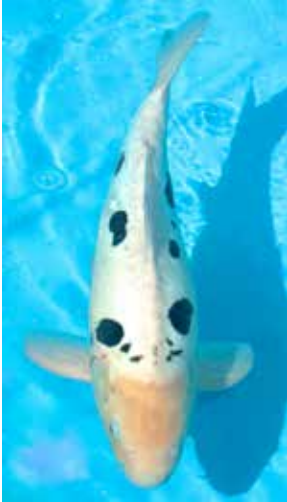
(4) This Kumonryu is a little short in the body, not the best shape.