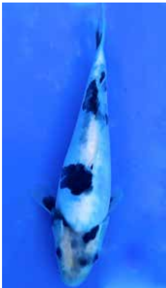
Non-metallic Doitsu Size 2 Heinz Zimmermann (21cm) Breeder: