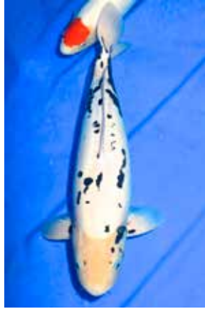
(17) A rather minimally patterned Kumonryu.