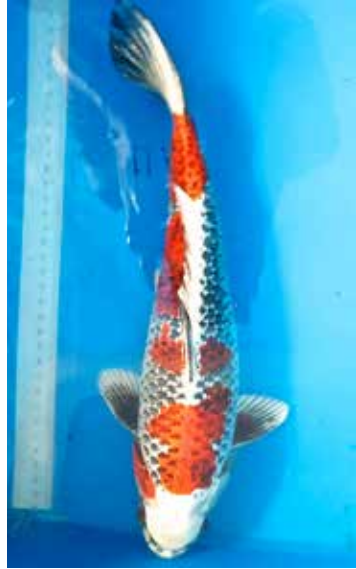
Hikari Moyomono TK Hing Size 3, Hikarimoyo (35cm)