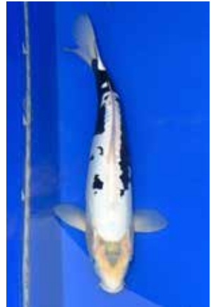
(15) A young kumonryu showing development of the classic dragon pattern sumi arrangement.