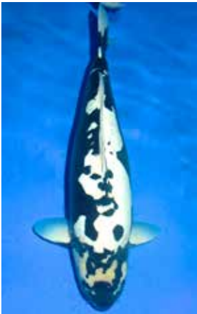
(19) White skin not bright enough