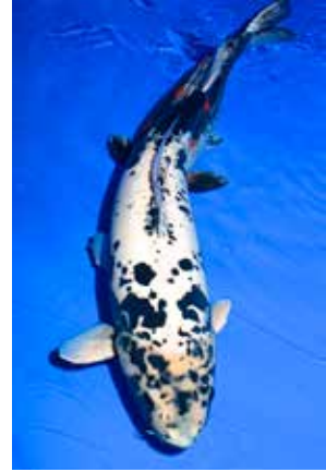
(18) Not a lot going right for this Kumonryu.