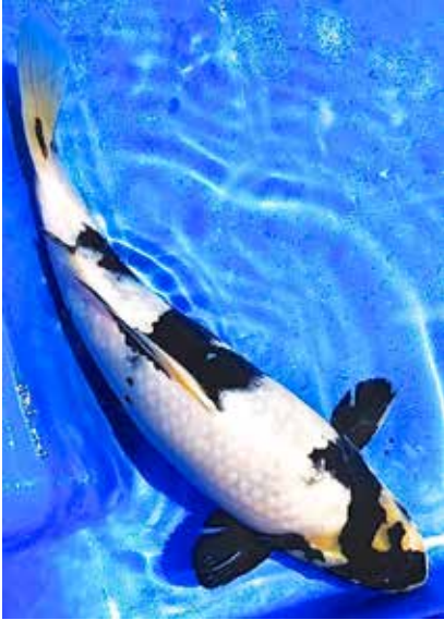
Utsurimono Edison Jap Size 2, Utsuri (25cm)