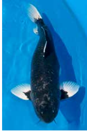
(5) Almost a Hajiro, but this koi was probably a Matsukawabake. Note the lighter patch over the shoulders.