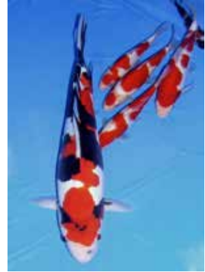
(24) A beautiful Beni Kumonryu.

patterns are very variable on this type of koi (photo 17). Very dense, lustrous sumi is an appreciation criterion and edges of the patterns should look knife-like: absolutely clean cut. White skin, where it appears should look snow-white (compare photos 18, 19 and 20). Unfortunately a grey or slightly brownish head is all too common for Kumonryu and detracts from their impressiveness – particularly since the head is often white alone with no sumi patterns. Kumonryu are slow growing and large examples, even today, are rare. As for other Karasugoi, the extent of sumi tends to increase with age and a once beautifully patterned Kumonryu can end up almost completely black, a rarely reversible change (photos 21, 22 and 23). In more recent years the Beni Kumonryu has made an appearance, with red patterns alongside or completely replacing the white areas (photo 24). This very attractive koi is thought to have been developed by crossing Kumonryu with Kikusui (doitsu Hariwake Ogon). The cross can (supposedly) result in either Kin-Ki-Kokuryu (metallic koi) or the non-metallic Beni Kumonryu. However, I am not sure if anyone in Australia has attempted this cross although other pairings, (for example Kumonryu and Kohaku), have been experimented with and found very disappointing with respect to producing Beni Kumonryu. Still a work in progress! ■