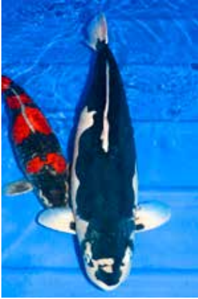
(22) The same koi in 2021, still a champion.

as finished, visible sumi is absolutely solid and very high quality, the reticulated, unfinished sumi is viewed as part of the truly fascinating patterns these koi carry. If present, solid white areas should look snow white. Matsukawabake can appear truly stunning, even more so if they carry gin-rin scaling (see photo 2).