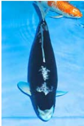
(14) Another very dark Matsukawabake showing excellent sumi.