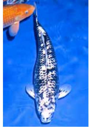
(6) A rare Suminagashi.