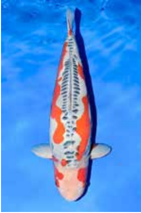
(16) This Hana Shusui shows the desirable position for sumi patterns on a Kumonryu.