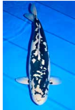
(21) A Champion Kumonryu in 2016.

it is from the Asagi Magoi line. Matsukawabake are named for 'seasonal changes'; their black and white patterns are quite variable and have been described as reversing in positions between summer and winter, although I have not observed this. However, they are definitely changeable and tend to become darker with age. The most easily recognisable distribution of black and white on a Matsukawabake includes black over the nose,