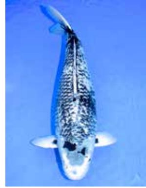
(12) An unusual but attractive Matsukawabake.