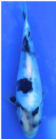
Non-metallic Doitsu Heinz Zimmermann Size 2, Non Metallic Doitsu (21cm)